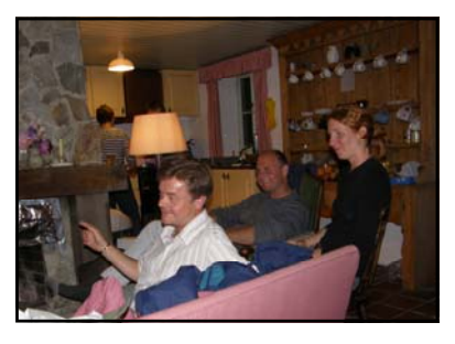
Inside the Gate House